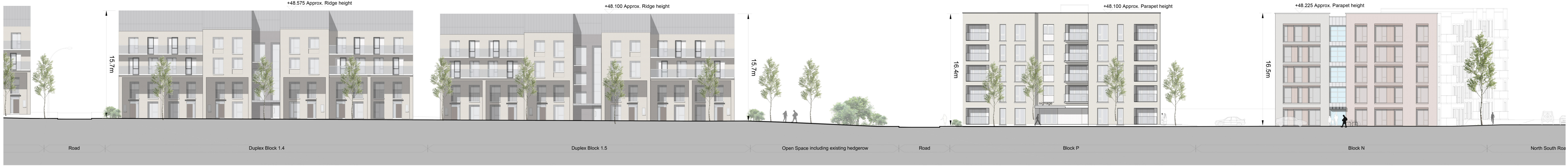
SECTION A-A Continued 2/3

This drawing is copyright 1. Do not scale this drawing 2. Errors and omissions to be immediately notified to the Architect 3. All dimensions to be checked on site.