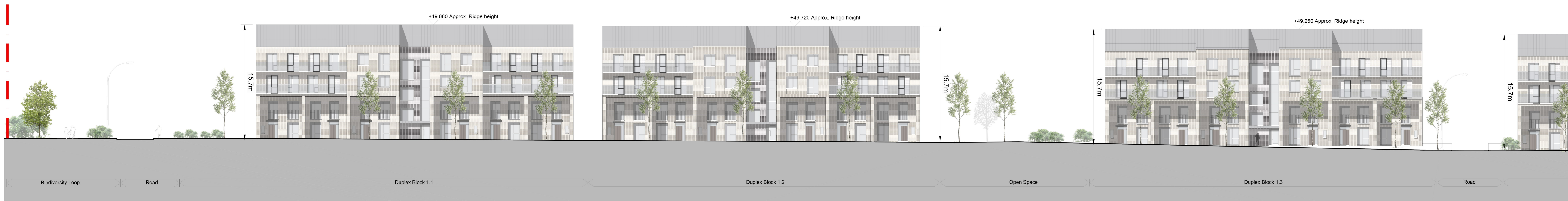
SECTION A-A 1/3

This drawing is copyright 1. Do not scale this drawing 2. Errors and omissions to be immediately notified to the Architect 3. All dimensions to be checked on site.